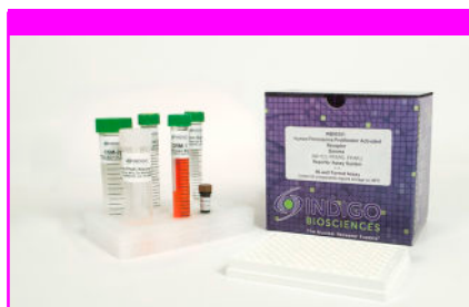
Indigo Assay Kit

In 2011, funding from the CCIDC's Revolving Loan Fund, combined with local bank financing, provided the necessary working capital for the expansion of the company's